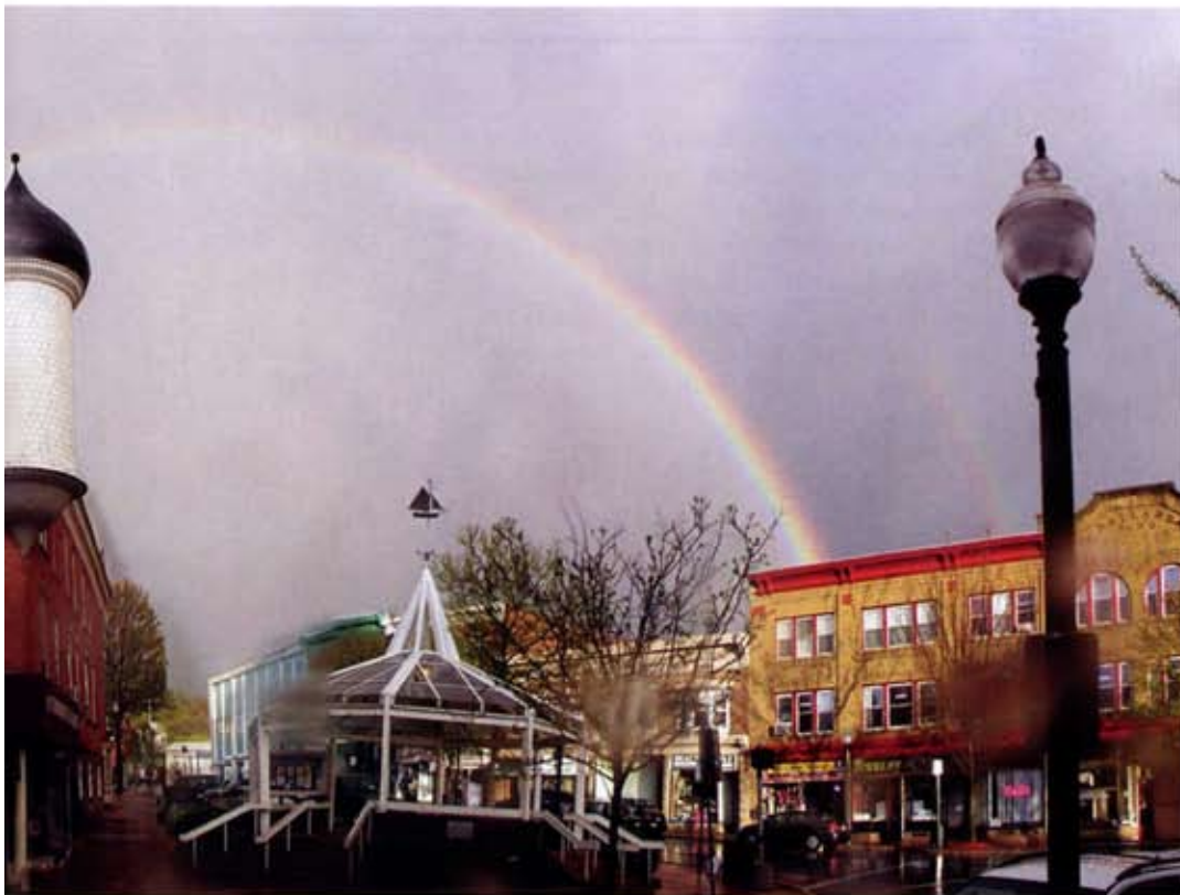
A real estate pot of gold? Stretching over the heart of Peekskill's downtown, a rainbow illuminates Peekskill's Division Street, better known as Restaurant Row, and two of its best known landmarks: the turret on the Submarine Galley building and the downtown Gazebo.